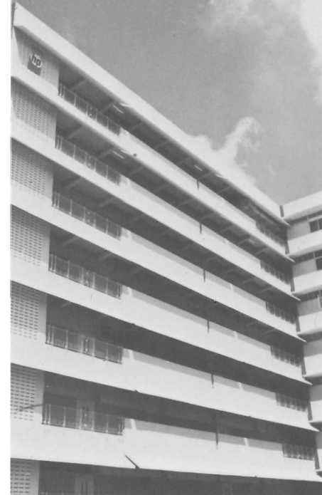
From HP Singapore's 6th and 7th floor quarters (seen above), the contrast of old and new Singapore is strikingly apparent. In foreground of photo at left is a remnant of the old Asian village or kampong; above it are some of the many new blocks of high-rise, low-cost housing that are displacing the kampongs.

recordy it has begun assembly of low-cost hot carrier diodes for HPA Division in Palo Alto. This will add a new dimension to HPA's marketing program which previously was devoted solely to premium components of a custom nature. The Singapore products, using IC chips produced at HPA, will put HP diodes into a much wider range of electronic placts such as home television sets and other solid-state consumer products. In no sense does this take work away from HPA; in fact, the components division will most likely have to boost its production effort because of HP-Singapore.