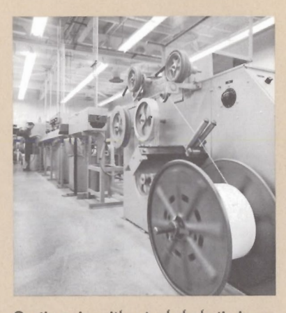
Coating wire with extruded plastic is one phase in the production of Paeco electronic cable. Tending the extruder is Richard Pahler.