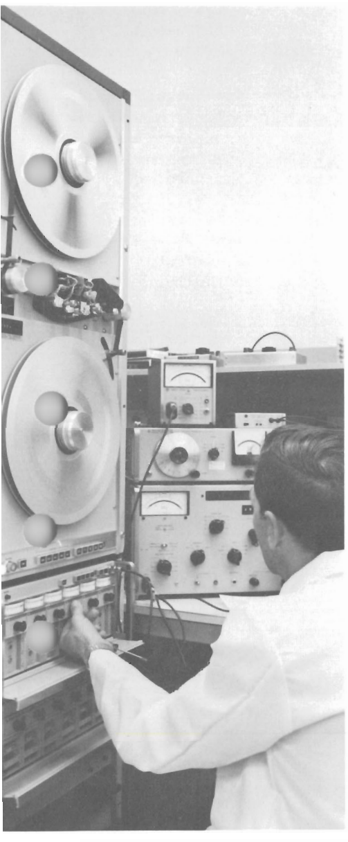
Bill McPeak, Paeco test technician, tests new 1.5 mc tape head with new Microwave tape fransport. Tape head must be within 3 microinches of flatness and feature a gap less than 30 microinches across—one-hundredth the diameter of a human hair.