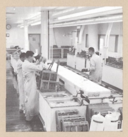
"Best plating operation on the coast" is one knowledgeable description of HP's new printed-circuit facilities at Paeco plant.