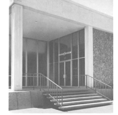
HP Perspective: Paeco Division