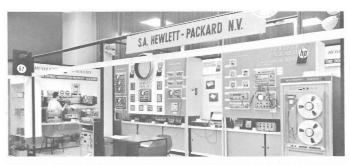
HP's participation in recent European trade shows included booths at Brussels (upper) and Hanover (lower).