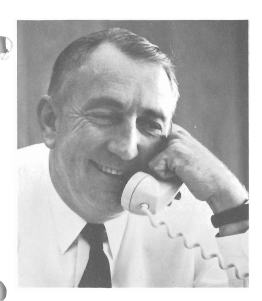
from the chairman's desk

AS INDICATED IN OUR INTERIM REPORT to stockholders, we have made excellent progress during the first half of the current fiscal year. Shipments and incoming orders were both up 18% over the corresponding period last year, and net profits were up 44%.