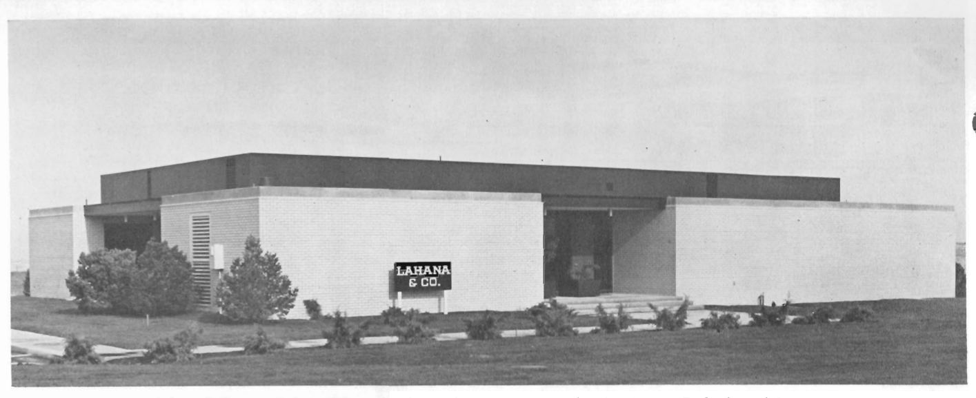
Lahana & Company's beautiful new building is first structure completed at Denver Technological Center.