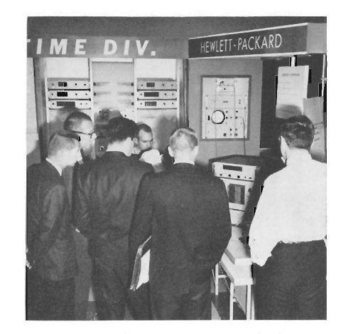
Frequency synthesizer was one of the most significant new instruments introduced by any company at the New York IEEE show in March.

NEW SYSTEM of processing orders gets trial run between Palo Alto and Loveland . . . New frequency synthesizer is announced and described to stockholders at annual meeting . . . Three booths at the International Exhibition of Electronics Components in Paris feature products from HP's German, English. and American companies.