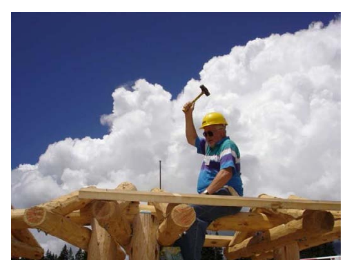
photo of me working on the information kiosk at Cumbres Pass at 10.000 feet.

The Friends have professional tools in the wood shop and machine shop. This is very important, because any restoration has to be performed following the original specifications. In addition, it is cheaper to manufacture large bolts on the lathe, rather than buying them. Needless to say, I am learning a lot of new techniques.